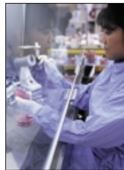
FIGURE FOR EXERCISE 55